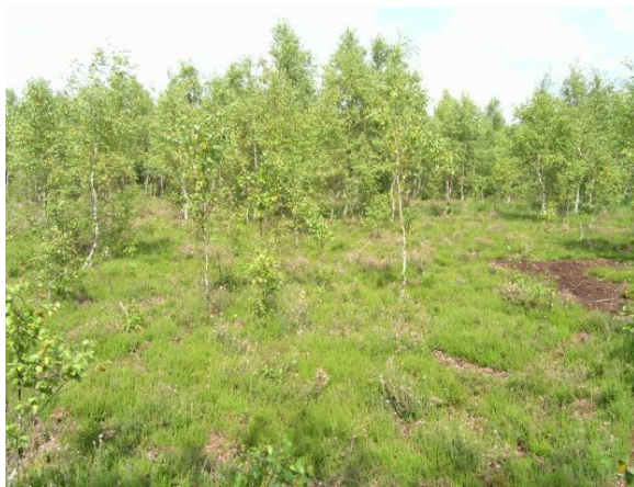
Erica locality before the action (spring 2004) ..

Planned, but as a result of weather conditions in autumn 2004 the water level on this site rapidly grow up. As a result this action became impossible. It will be executed in spring 2005, when the water level will decrease.