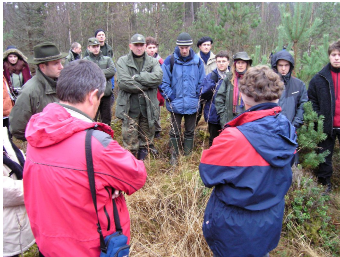
Field discussion during the workshop