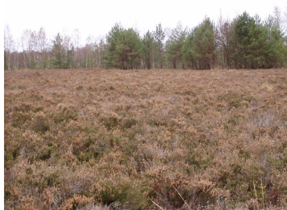
.....and after (autumn 2004) ..