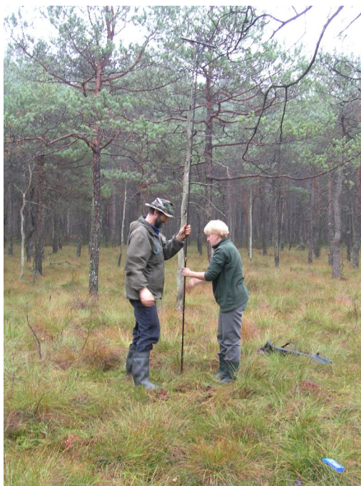
Photo: peat stratigraphy analysis using the peat borer